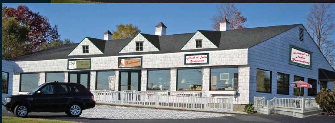
Rendering shows potential renovation to building